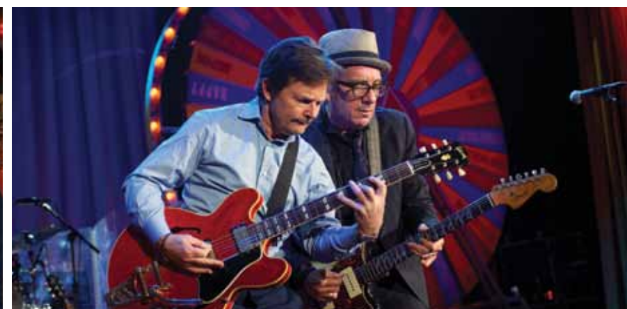
Michael J. Fox performs with Benefit co-chair Elvis Costello.