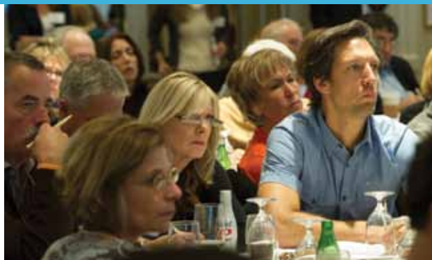
Patients and loved ones gain access to the latest news in Parkinson's research.