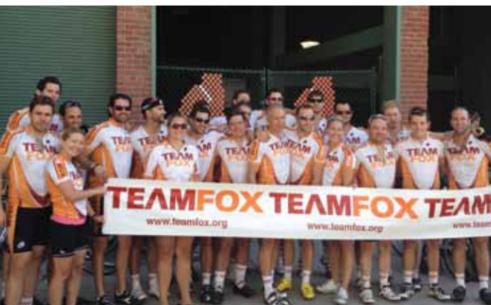
Team Bikes Battle Parkinson's, an annual bike ride across North America