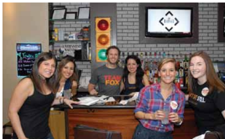
The Team Fox Young Professionals of New York at their March Madness Happy Hour