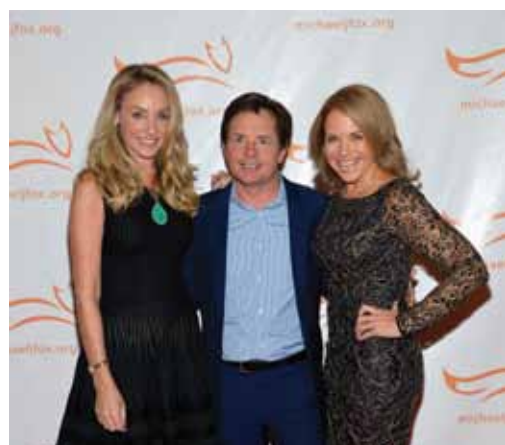
Tracy Pollan and Michael J. Fox with Benefit Co-Chair Katie Couric