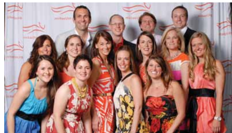
The Team Fox Young Professionals of Chicago host their inaugural gala event, Party Like a Fox.