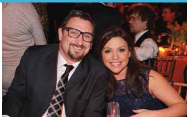
Rachael Ray with Top Chef Master Chris Cosentino