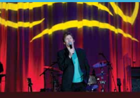
Denis Leary kicks off the night as host.