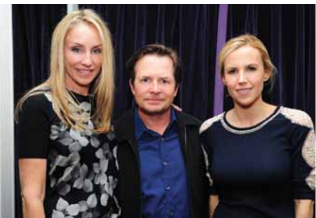
Tracy Pollan and Michael J. Fox with Tory Burch at an evening of shopping and cocktails to benefit MJFF.