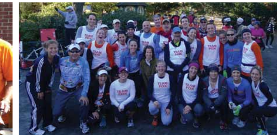
Although the 2012 ING NYC Marathon was cancelled due to Hurricane Sandy, Team Fox runners came together to help the cleanup effort and run in Central Park.