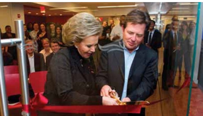
MJFF Board members Lily Safra and Michael J. Fox cut the ribbon at the dedication of The Edmond J. Safra Conference Room.