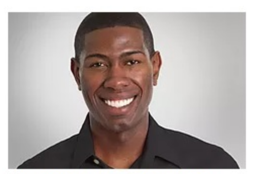
Include a photograph to familiarize potential participants with the study team.

"Include a statement explaining how the study advances Parkinson's research or/and potentially addresses a gap in patient's care."