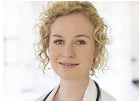
Include a photograph to familiarize potential participants with the study team.

"Include a statement from the principal investigator explaining how the study contributes to Parkinson's research and impacts the lives of individuals with Parkinson's disease."