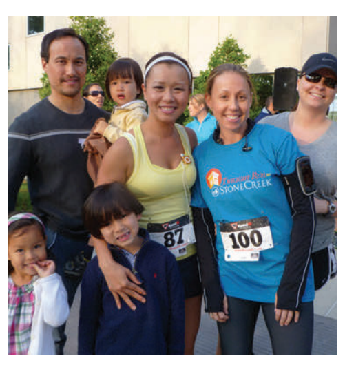
Participants from the 2013 Annual Stone Creek Twilight Run