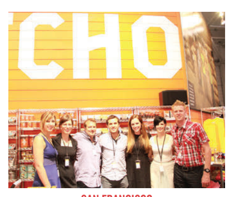
SAN FRANCISCO Established in: 2011 Signature Event: Foxes and the Chocolate Factory